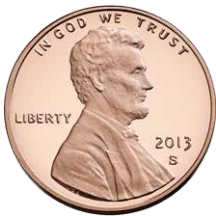
Penny = 1 cent