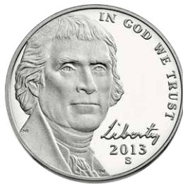
Nickel = 5 cents