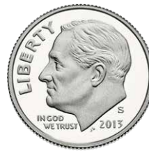
Dime = 10 cents