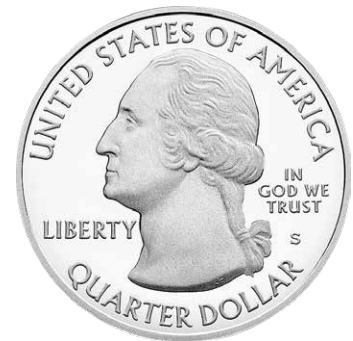
Quarter = 25 cents